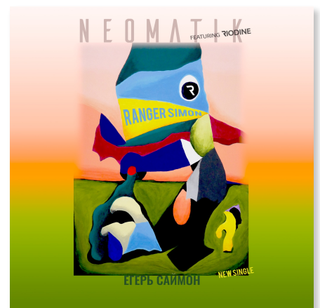
Ranger Simon (single) released: 08/19/2021